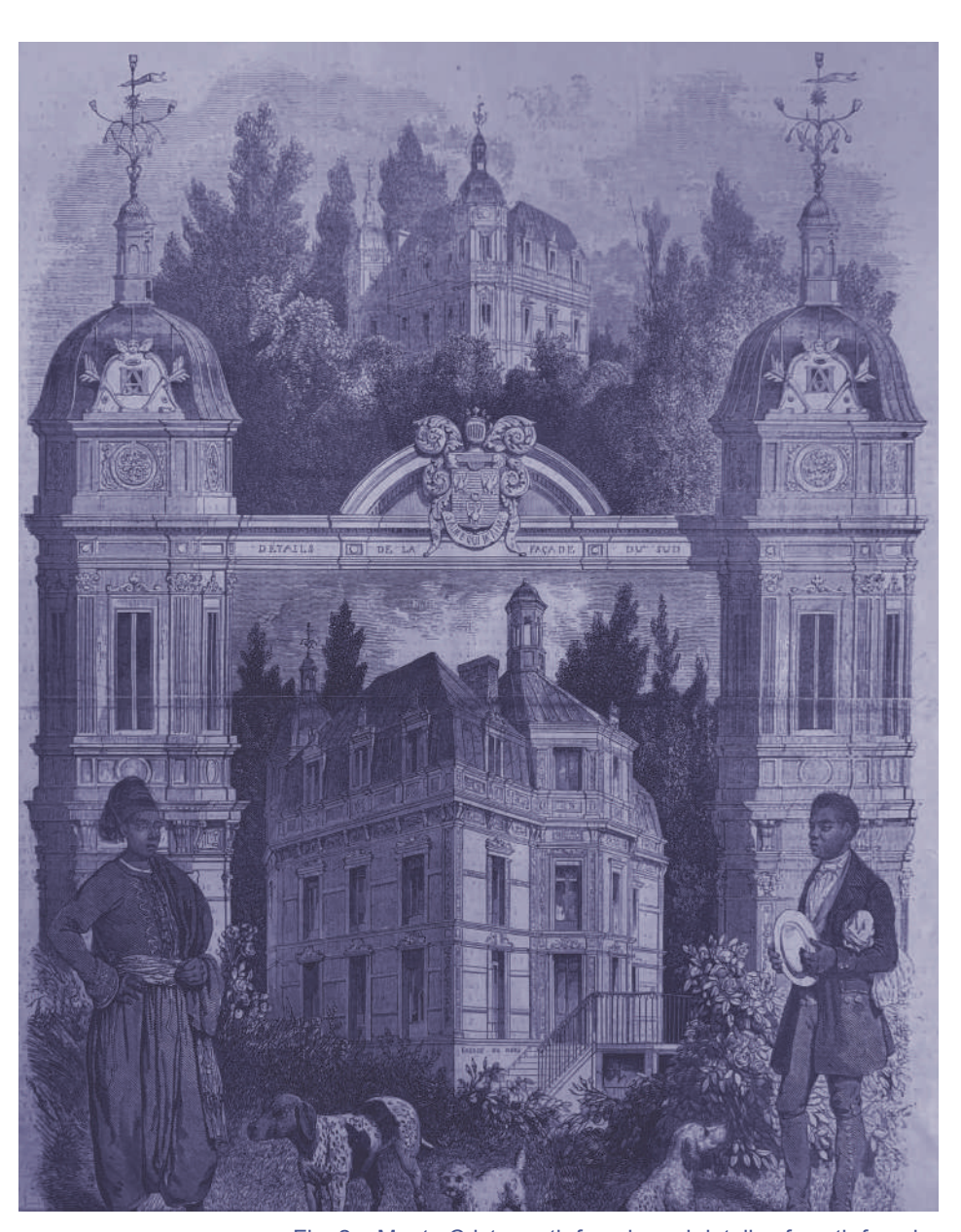
Fig. 2 – Monte Cristo north façade and details of south façade.

Inside, everything had been taken care of down to the smallest detail, with small but well laid out rooms. In the basement were the kitchens. On the ground floor there was a dining room with sculpted woodwork (Fig.3), a waiting room and an intimate reception room with real cashmere curtains<sup>21</sup>, where Dumas displayed his collection of weapons (rifles, carbines, Arab pistols, swords, sabres, daggers, knives, etc.)22. Each stained-glass window had drawings evoking different activities or earthly pleasures, with a theme in each room: musical instruments, board games, food, etc. On the upper floors the decoration was exuberant, with Persian, Gothic, Renaissance, Henri II and Louis XV style salons, filled with luxurious tapestries, furniture (gondola chairs, ebony wood gaming tables, marquetry desks), paintings (Delacroix, Decamps, Bonhommé) and sculptures (Auguste Préault, James Pradier, Antonin Moine), which left the guests speechless. The Arab salon stood out, with its ceilings