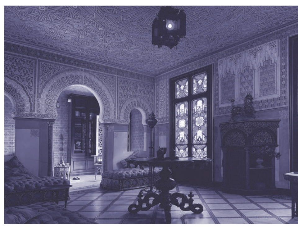
Fig. 4 - The Arab salon