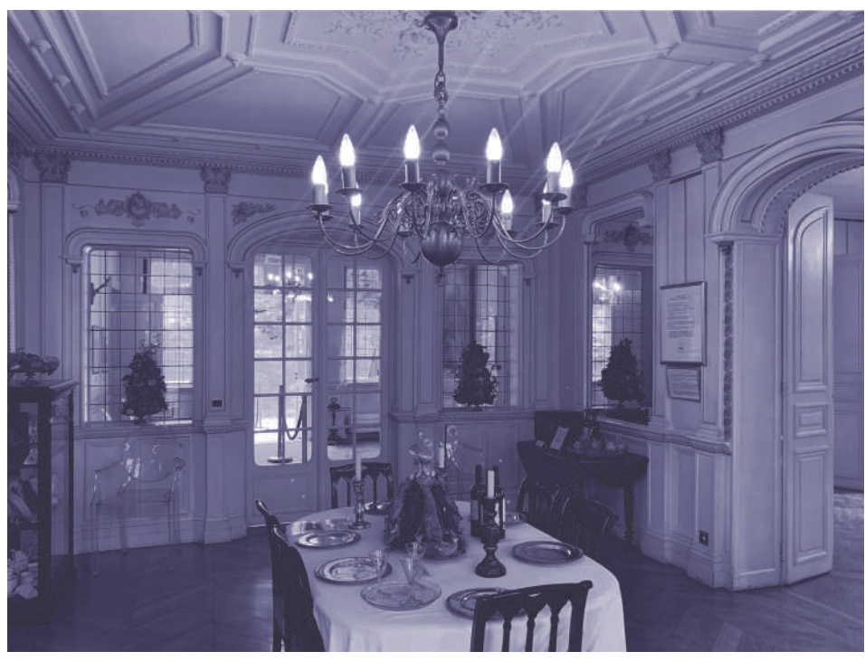
Fig. 3 – The dining room