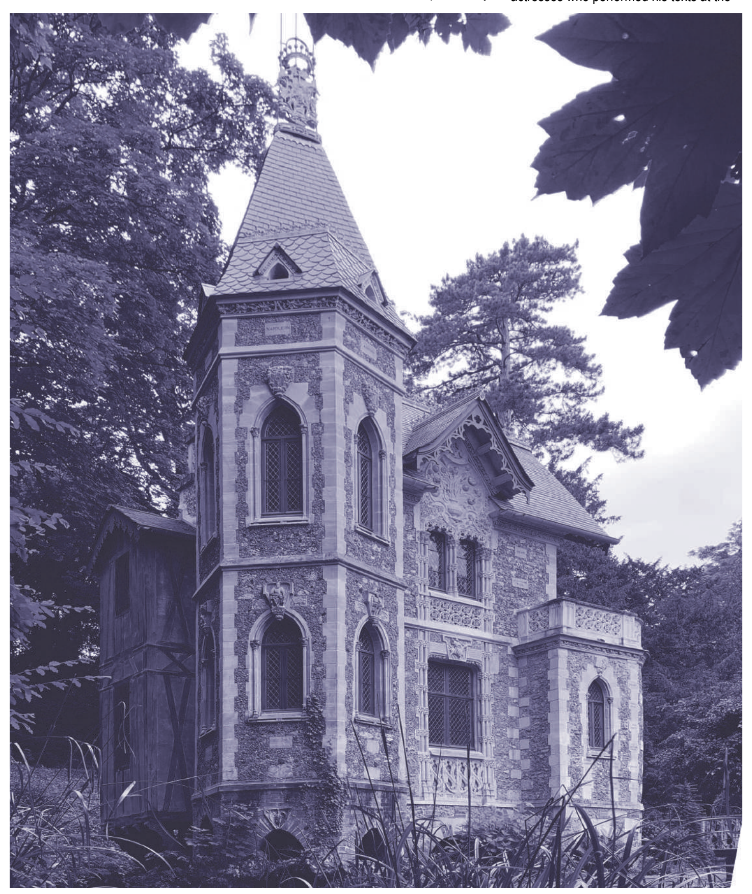
Fig. 6 – The Château d'If pavillion

revitalised the quiet village of Saint-Germain-en-Laye, where the train arrived from the capital, filling it with curious onlookers who came in the hope of seeing the popular writer. The party went on, day and night, along with adventures with the actresses who performed his texts at the