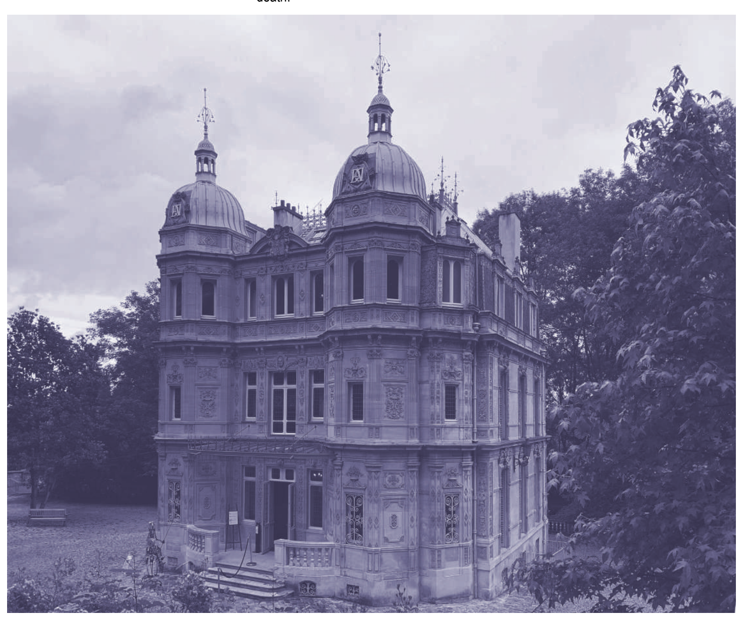
Fig. 1 – Monte Cristo south façade.

Guests discovered the appearance of a monumental folly, a reflection of the excess in which Dumas lived. The