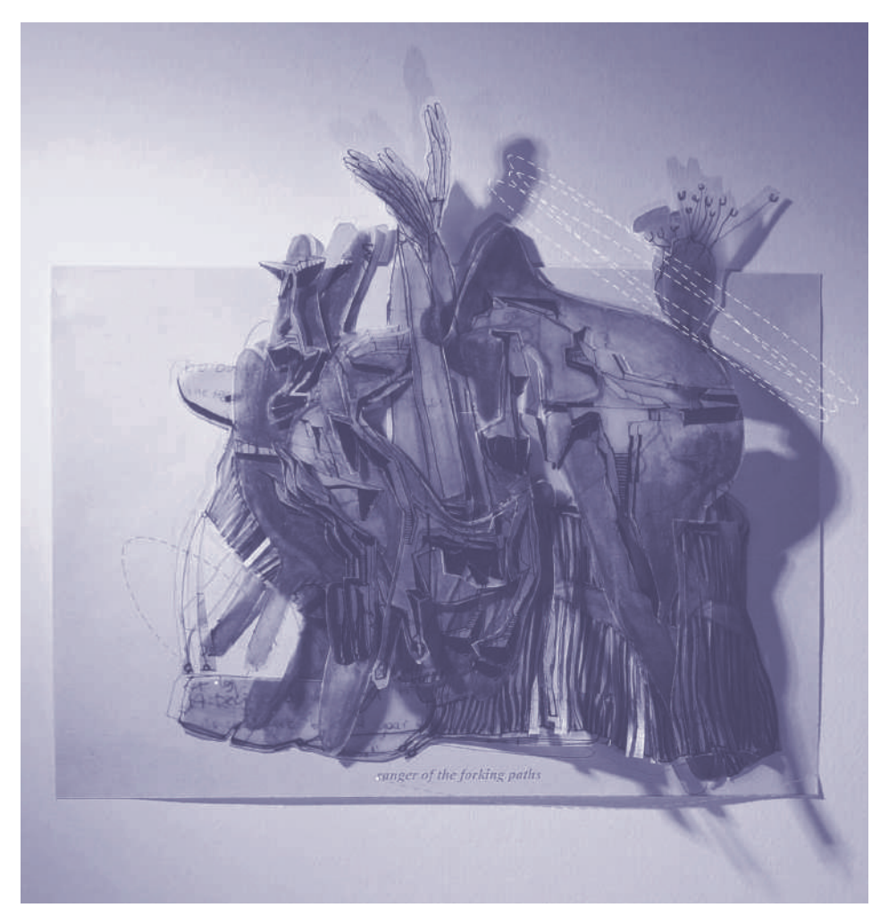
Fig. 6 - The illustration of the new osmotic border as a multilayer catalyst.

users provoke homes to their ultimate form by their imaginative interactions. They then clad on their home and exert their everyday to its extremes; Rangers appear in the reflection of this unusual interaction. They thus are unbounded and autonomous in their spatial endeavours. I suggest that the folly-ness of Rangers is rooted in this aspect. They perform architecture, enjoying the stripping off of the program and reason to the fullest for their pleasure.