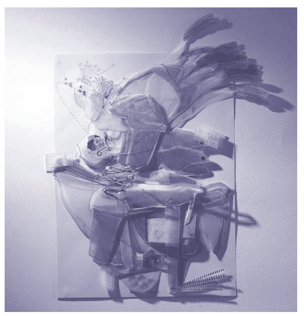
Fig. 5 - Online Ranger : The illustration of the new osmotic border as a multilayer catalyst.

The performative existence of the three; architecture, the user and the architect comes with critically situated configurations. Domestic space –what we refer to as home –is an intriguing field to look at in this configuration. Home is an intricate spatiality that demands function and program and contains the fragments of desires and memories. Yet as Tschumi advertises; 'Architecture is defined by the