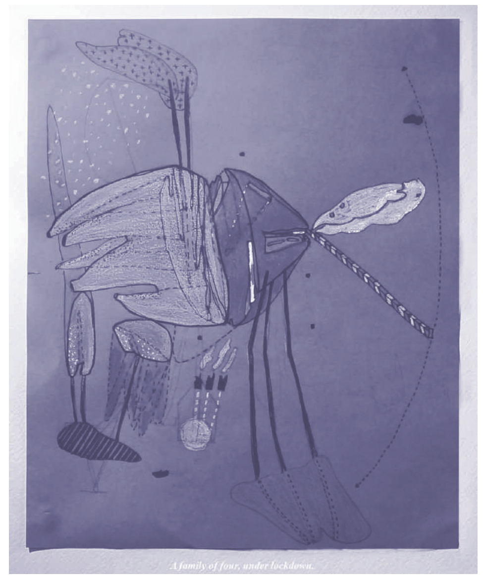
Fig. 2 – A Family of Four Under Lockdown. Here we see a pair of parental figures in the attempt of a balancing act; pushing and pulling each other. One hides the infant figures under its shadow meanwhile the other guards the gates with its tail. A sketch of turmoil, prior to Rangers.

and neutral.<sup>19</sup> Le Corbusier's famous definition 'A house is a machine for living in'<sup>20</sup> simply positions a passive user . the operator of a machine with a toolset. The users of Sarah Wigglesworth's Table Manners are reactive. They bend the reality of the table by embedding their everyday life as a disorder for the architects.<sup>21, 22</sup>In the case of John Hejduk's Masques, the subjects and objects are part of matrices. They meet each other in endless combinations of performative interactions. The subjects and objects of the Masques are the creative users where their actions and imaginations define and make the space they inhabit.<sup>23</sup> It's not likely to stay as one kind of a user, our position as users changes. Every performer's role and action depends upon the situated positions of the spatial making.