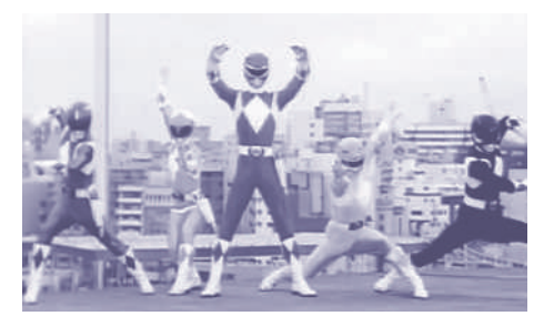
Fig. 1 - 'Mighty Morphin Power Rangers, Starting Roster.'

My research on Rangers is in the form of a series of drawings. I take on this matter by speculatively pursuing how these architectural formations might be, enfolding quasi-facts of first-hand experience, social media news and Twitter trending topics. Throughout this writing, Rangers pop up in between the text, claim the surface of the manuscript as figures, captions and accompanying text to tell their stories. Understanding their stories is not a straightforward process; they demand careful observation and interpretation of what they show and tell.