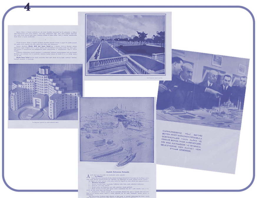
Fig. 8 - Rendering/Modelling.

narrative in architecture, visuals and models are representations that reflect the projections of architects/planners trying to