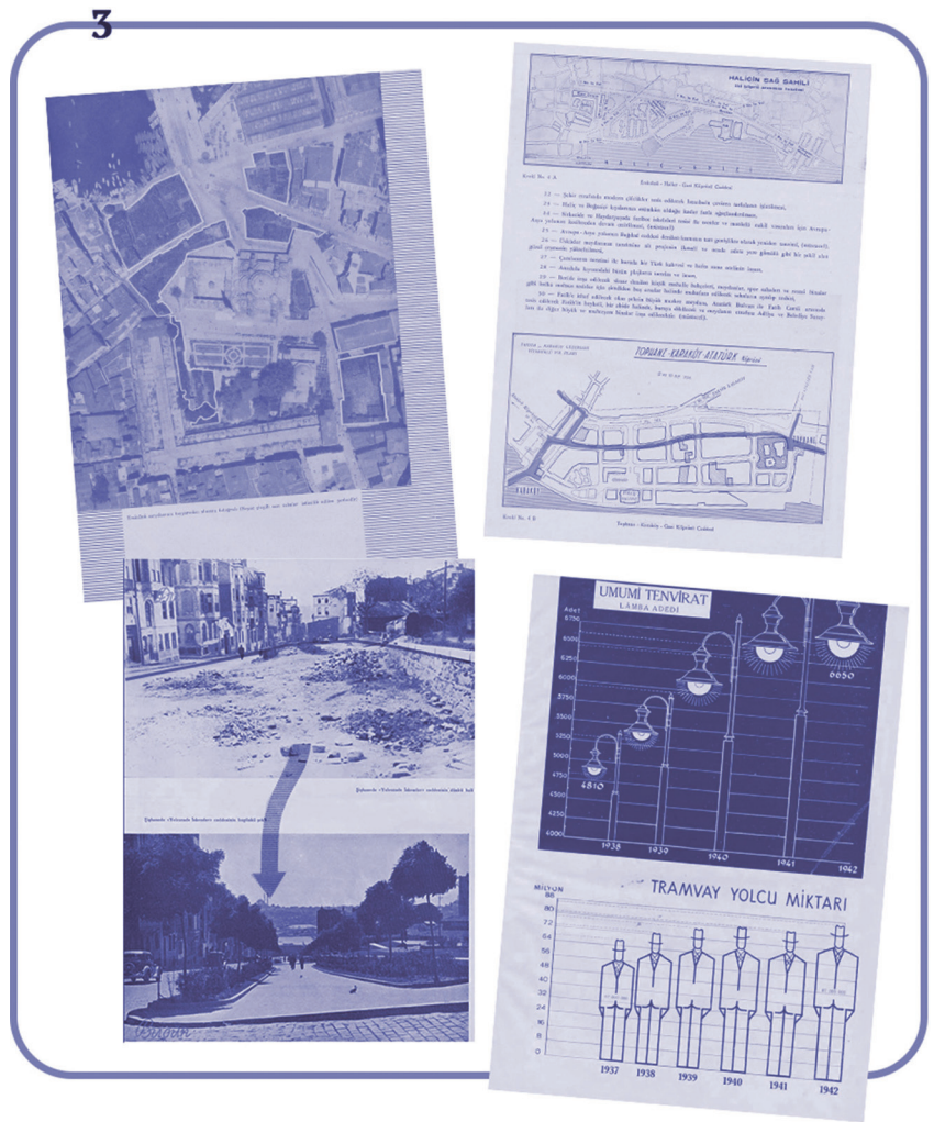
Fig. 7 - Diagramming/Mapping.