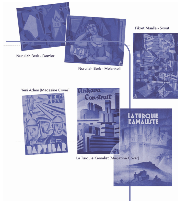
Fig. 3 - Examples of Common Visual Language of Early Republican Period.

mapping, comparative photography and so on (Fig. 4). In addition, the fact that Resmor - who designed the graphics of the booklet - received an art degree in Paris during the feverish period of the avant-garde movement (such as Group D painters who