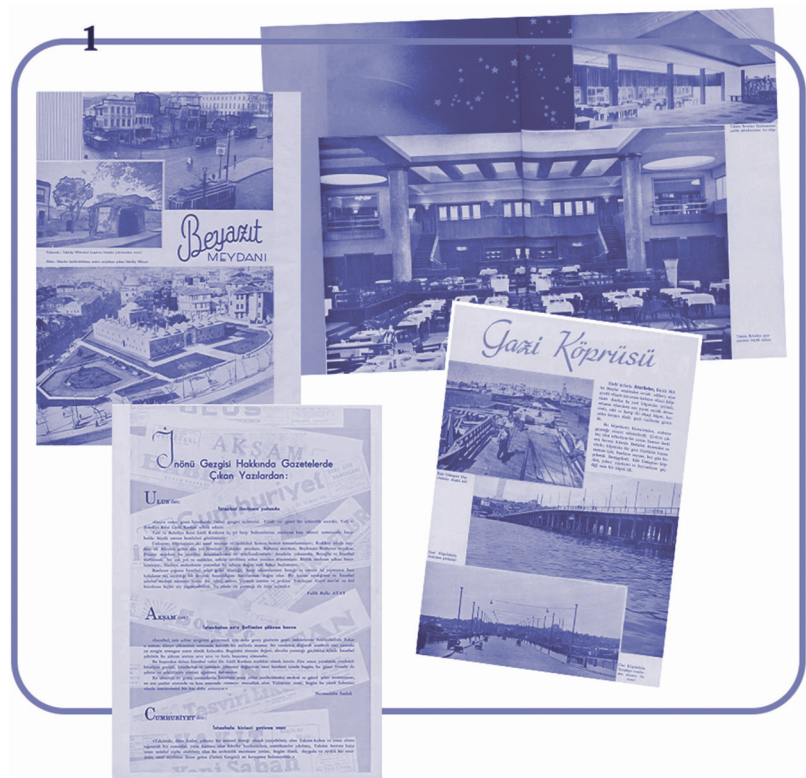
Fig. 5 - Use of Paper Space.

Collages and montages produced analogously using different photographs appear as the shortcut technique frequently used in the booklet to give an image of the envisaged beautifying of Istanbul. In the Early Republican Period, the “cleaning” of the dilapidated buildings around the monuments and the “revitalization” of the monuments are common motifs of urban discourses. Photographs