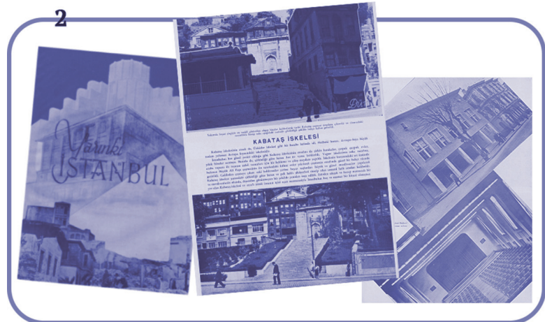
Fig. 6 - Collage.