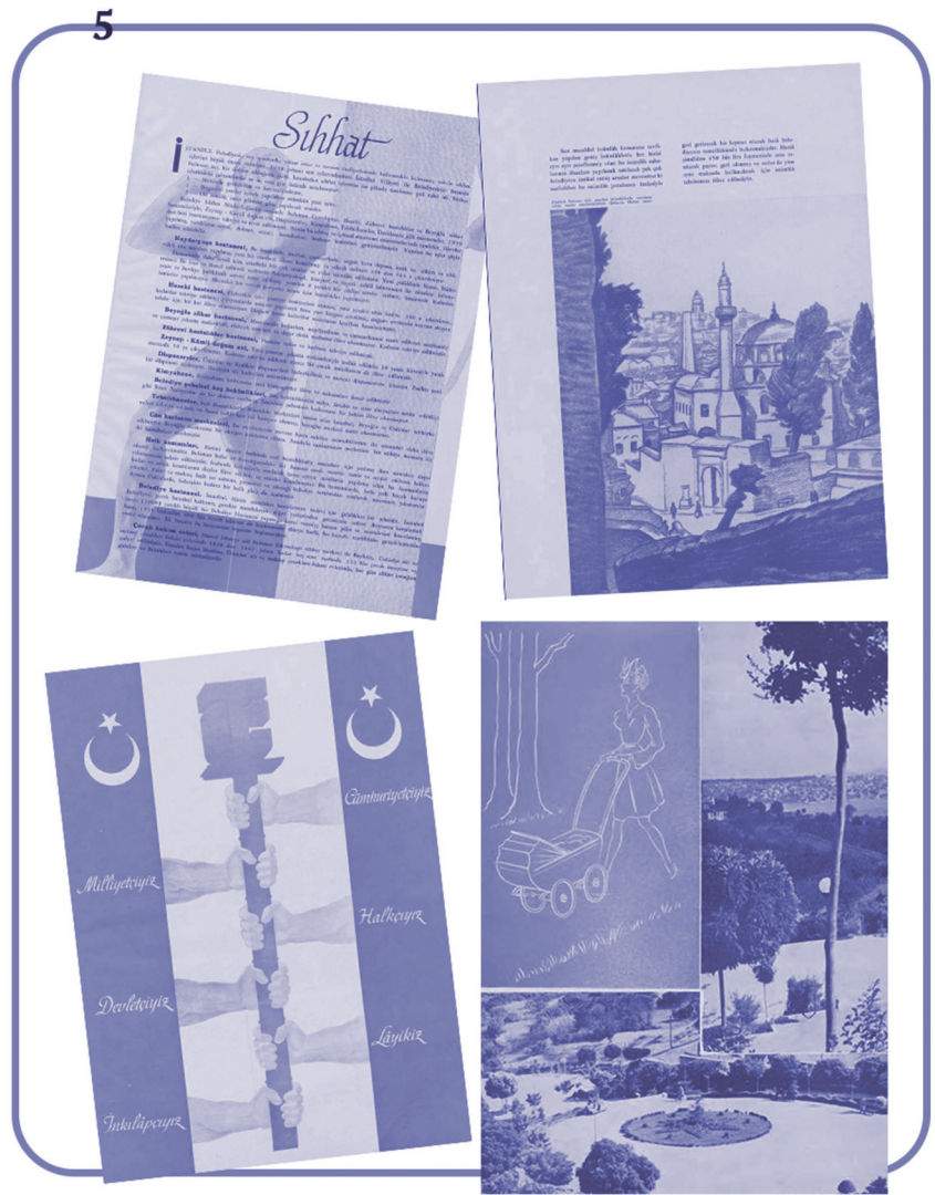
Fig. 9 - Figures/Paintings.

Places that have been “transformed”, “cleaned” or “revitalized” in the recent past are narrated with comparative photographs in Güzelleşen İstanbul , which conveys the state of Istanbul’s gradual “beautification” in line with its title. A photograph showing the dilapidated buildings in front of the New Mosque and a wide perspective photograph of the proposed emptied square are placed side by side and the