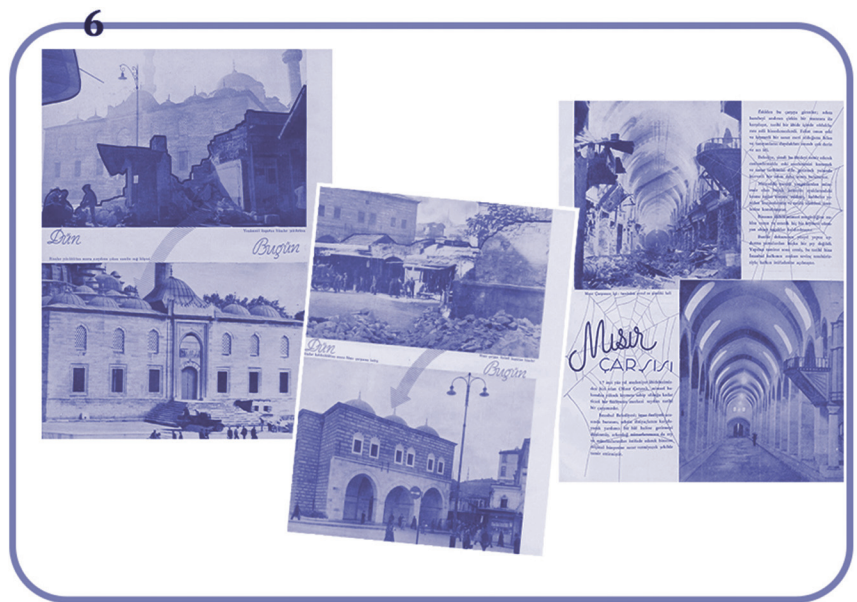
Fig. 10 - Comparative Photography.

transition from the old to the new is highlighted by an arrow. The elimination of a building group that is claimed to make pedestrian access difficult is also expressed