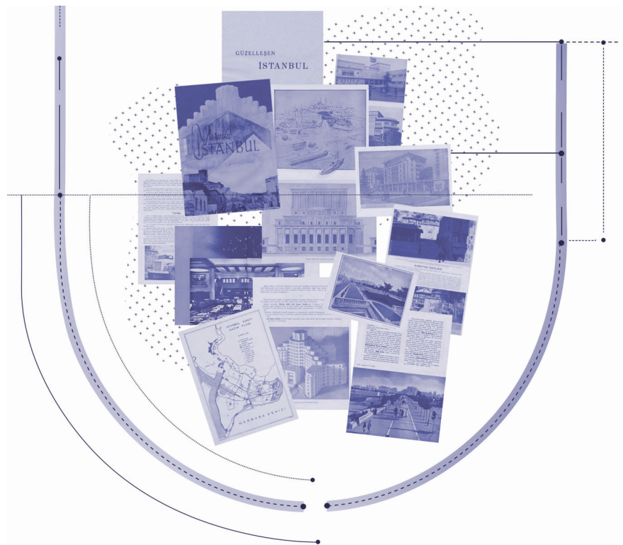
Fig. 4 - Pages from Güzelleşen İstanbul .