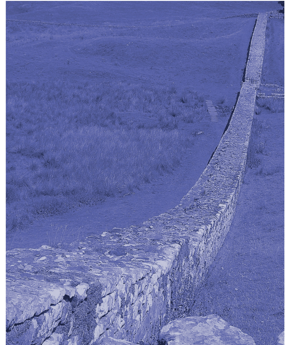
Roman Limes Hadrians Wall.