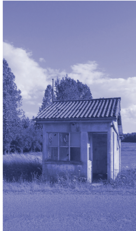
Poste Douanes F-B.

Finally in section 1, but still on the theme of water – land borders, Doina Carter's paper on 'Fluid boundaries: architectural tool kits for water-lands' uses the UOU workshop idea as a basis for seeing how communities living on these borders are impacted by changes in weather and how groups of architecture students responded to the challenge of conceiving ways to alleviate problems associated with this. Doina's conclusion that group working produces better results is a testimony to the UOU workshop model.