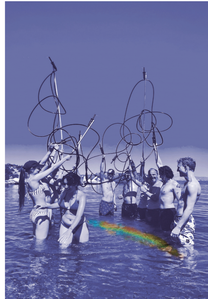
Ws Alicante / Tabarca Island.

This article completes the trilogy of writings that began with "A New Learning Model for UOU," published in Letter from the Director UOU sj#05 (June 2023). In that article, the methodologies incorporated by the UOU network into our international architectural learning project were explained.