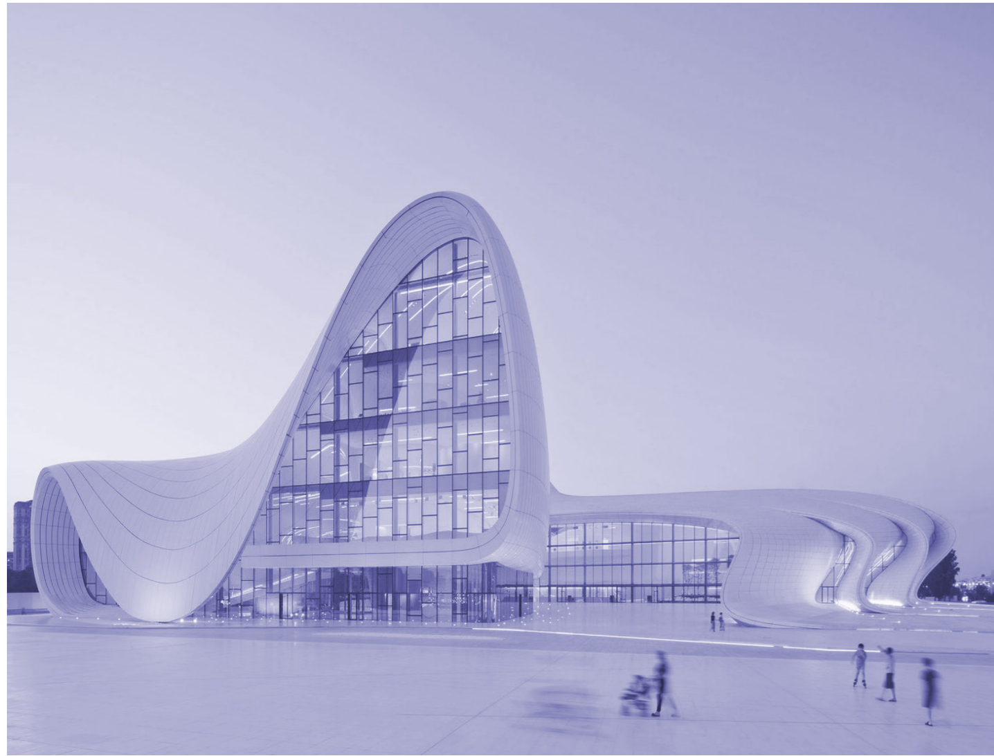
Fig.2 - The Heydar Aliyev Center (Source URL 2)

the amount of solar heat gain in summer, meaning the building would require less artificial cooling to create a comfortable interior environment. This can help maximise energy use and reduce the lifecycle environmental impacts of a building. The Al-Bahar Towers in Abu Dhabi effectively used a responsive facade system that shades its surfaces depending on the intensity of sunlight, eliminating the unnecessary use of artificial cooling systems, maximising energy efficiency, and demonstrating the potential of parametric design (Fig.3).