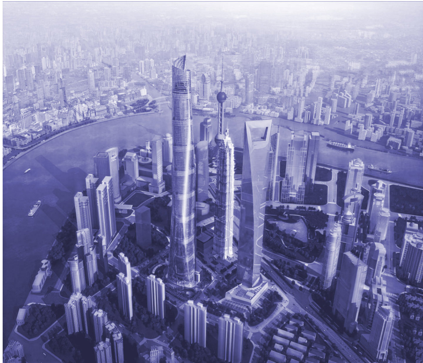
Fig.1 - Shanghai Tower Building in China.

collaboration between the designer and the client. It fosters enhanced teamwork within the architectural office, making everyone feel more involved and valued (Rohani et al., 2014).