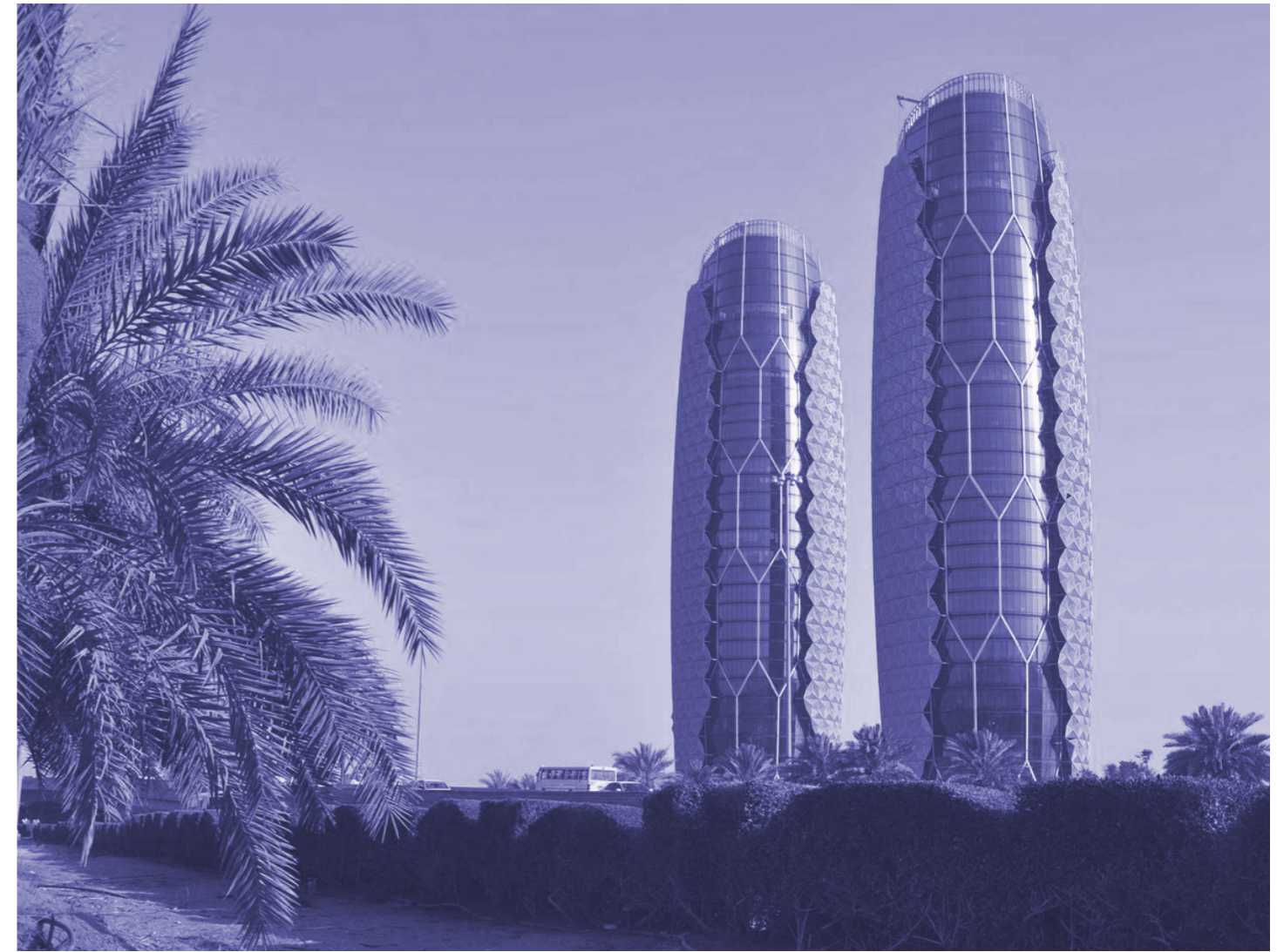
Fig.3 - Al-Bahar Towers in Abu Dhabi.

Several international case studies have shown that the power of parametric design can lead to truly innovative, sustainable architectural solutions. An excellent example is the Morpheus Hotel in Macau, designed by Zaha Hadid Architects. A free-form exoskeleton that markedly maximised structural efficiency, material performance, and structural geometry was developed through parametric design (Fig.5). It resulted in a fascinating, iconic, and, at the same time, efficient, sustainable building (Romaniak & Filipowski, 2018). Arguably one of the most ambitious and innovative projects to have utilised solar technology so far, One Central Park in Sydney combines parametric design with vertical gardens and a cantilevered heliostat that reflects sunlight into the surrounding areas, helping to boost urban biodiversity and reducing energy use (Na, 2021).