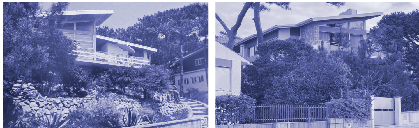
Fig.6 - Summer house on the slope (Sections 1 and 6), composite. Left: original state — tubular steel balustrade, wire mesh, timber soffit, terraced garden. Right: current state — frameless glass, stainless steel fixings, metal gate. The structure endures; the script has been overwritten.

13. The term "enacts" is used in its epistemological sense: the Narrator's writing performs the relational structure of the event, rendering visible connections that no single voice could produce alone. On narrative as knowledge production, see RICOEUR, Paul. Time and Narrative . Vol. 1. Chicago: U of Chicago P, 1984.