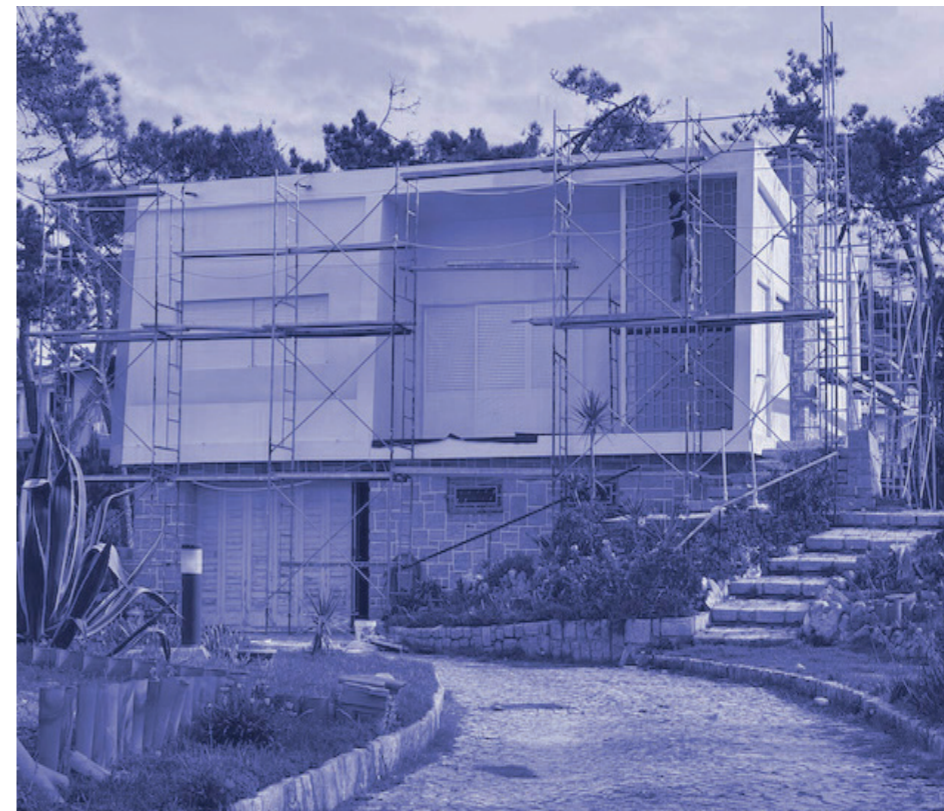
Fig.5 - The same house during intervention, November 2025. Uniform white replaces the original chromatic differentiation. New window profiles designed for continental thermal performance occupy openings calibrated for Atlantic light. The building permit's promise — 'simple and without artifice, valorised by different materials and colours' — is being overwritten in real time.

The process is cumulative and self-reinforcing. Each act of anti-repair diminishes the legibility of the original script. As proportions are altered and materials replaced, the house loses the capacity to communicate the logic of its own making — and the next inhabitant arrives into a dwelling yet more opaque to reading, yet more likely