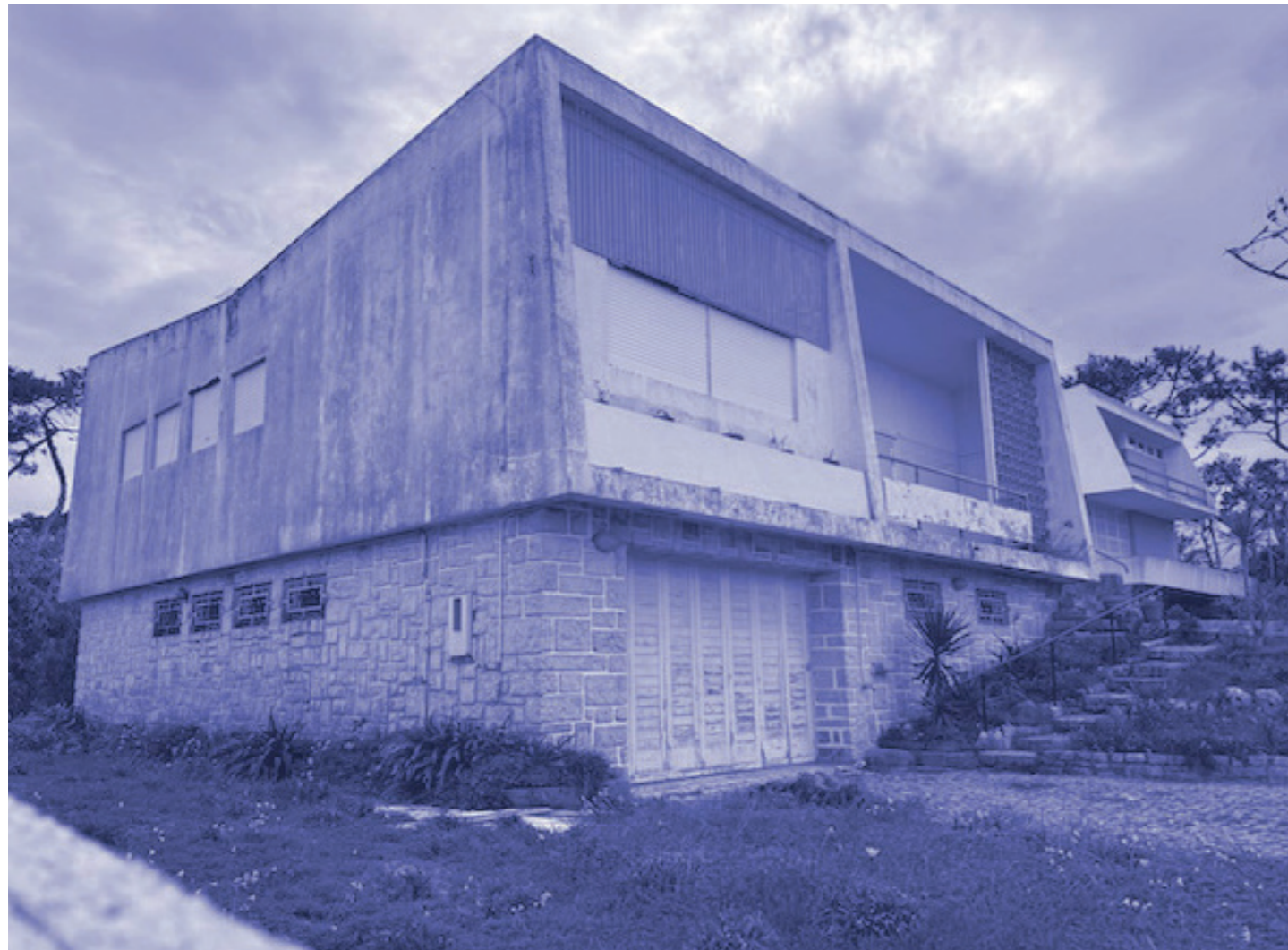
Fig.3 - The same house, 2024. Material weathering has advanced — concrete staining, paint erosion — but the architectural script persists: volumetric articulation, proportional openings, the dialogue between stone base and rendered upper volume. The house ages; it does not yet dissolve. Source: author, 2024.

present: its concrete frames, its flat roofs, its calculated openings persist, however altered, as legible structures (Fig.3). The architecture operates in slow time — material, tactile, calibrated to endure. The subject who now inhabits it moves at another speed entirely — accelerated, visual, oriented toward models that belong elsewhere. What has become vague is neither the ground nor the subject alone, but the temporal gap between them. And what we find here are not cool ruins but hot ones — dissolution that is active, contemporary, unfolding in real time, without the patina that permits contemplation. In São Pedro de Moel, the terrain is scripted. It is the human who is unscripted.