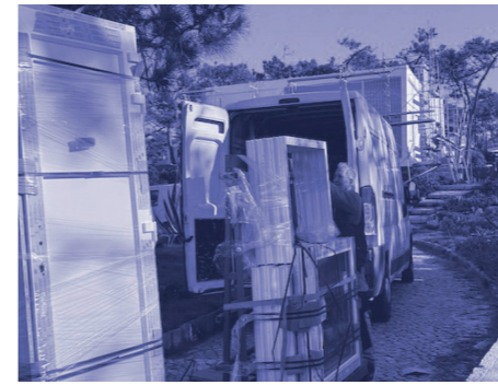
Fig.4 - PVC window frames awaiting installation at the same house, November 2025. The profile thickness exceeds the original hardwood frames — specified by the architect at 1:10 detail — by a factor of three. The intervention was undertaken without a building permit.

It translates into a pattern of intervention that might be called systematic anti-repair: the consistent alteration of precisely those elements that already functioned. 7 Original timber window frames, designed in proportion to the façade and to the Atlantic light, are replaced with oversized PVC profiles that interrupt the compositional logic of the elevation (Fig.4). Exposed concrete — left deliberately unfinished as an expression of material honesty — is clad in ceramic tiles imported from a suburban repertoire. A veranda is enclosed, severing the threshold between interior and forest. Each intervention presents itself as an improvement. Each one damages what was already sufficient — not out of negligence, but out of a desire addressed to the wrong structure. Each act of anti-repair is a temporal violence: the imposition of fast time — industrial production,